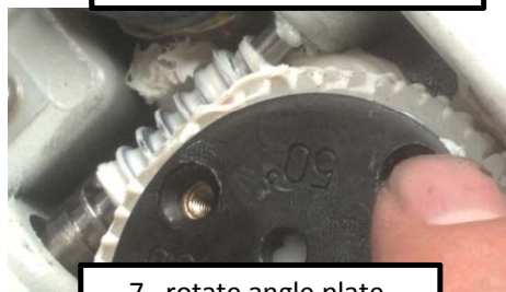
7. rotate angle plate, and fix the one you need towards worm shaft