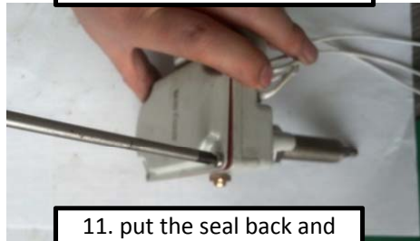
11. put the seal back and fasten the screw