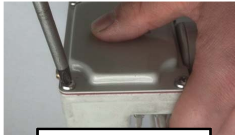
1. Loose screw