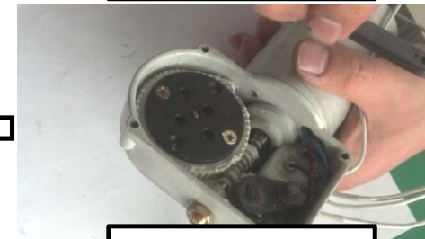
4. take off the link