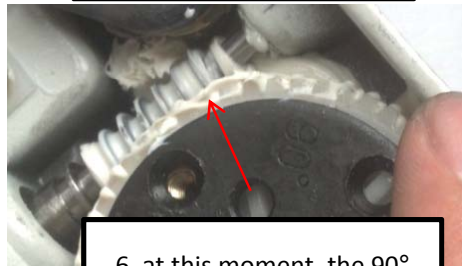
6. at this moment, the 90° hole is towards worm shaft