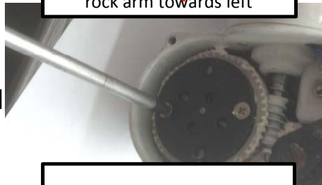
5. loose screw