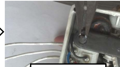
3. remove circlip