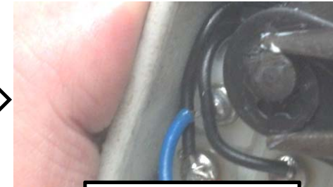
9. put the circlip back