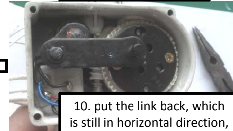
10. put the link back, which is still in horizontal direction, rock arm towards left